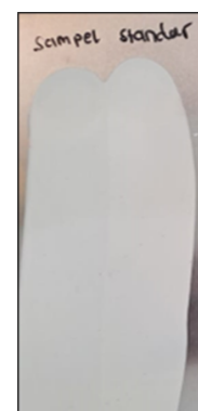
Fig 2. Visual appearance of paint formulated with eggshell-derived \text{CaCO}_3 as extenders (Sample).